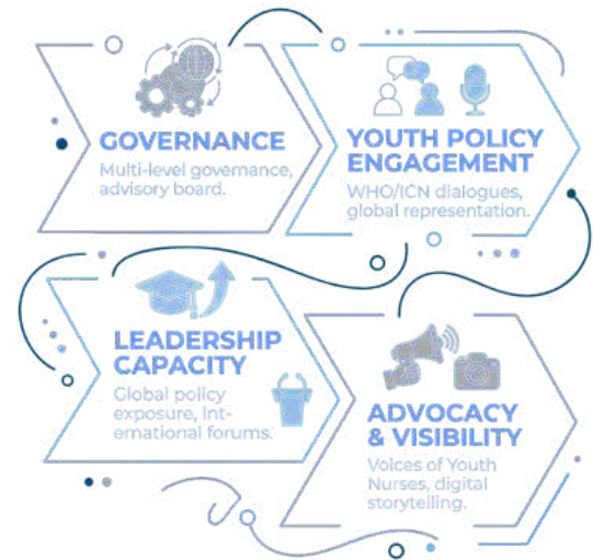
Fig.1: Strategic pillars of action at EMR-YNI

In 2025, EMR-YNI structured its work around five interconnected strategic pillars. These pillars guided the initiative's governance, advocacy, capacity building, and regional alignment efforts throughout the year.