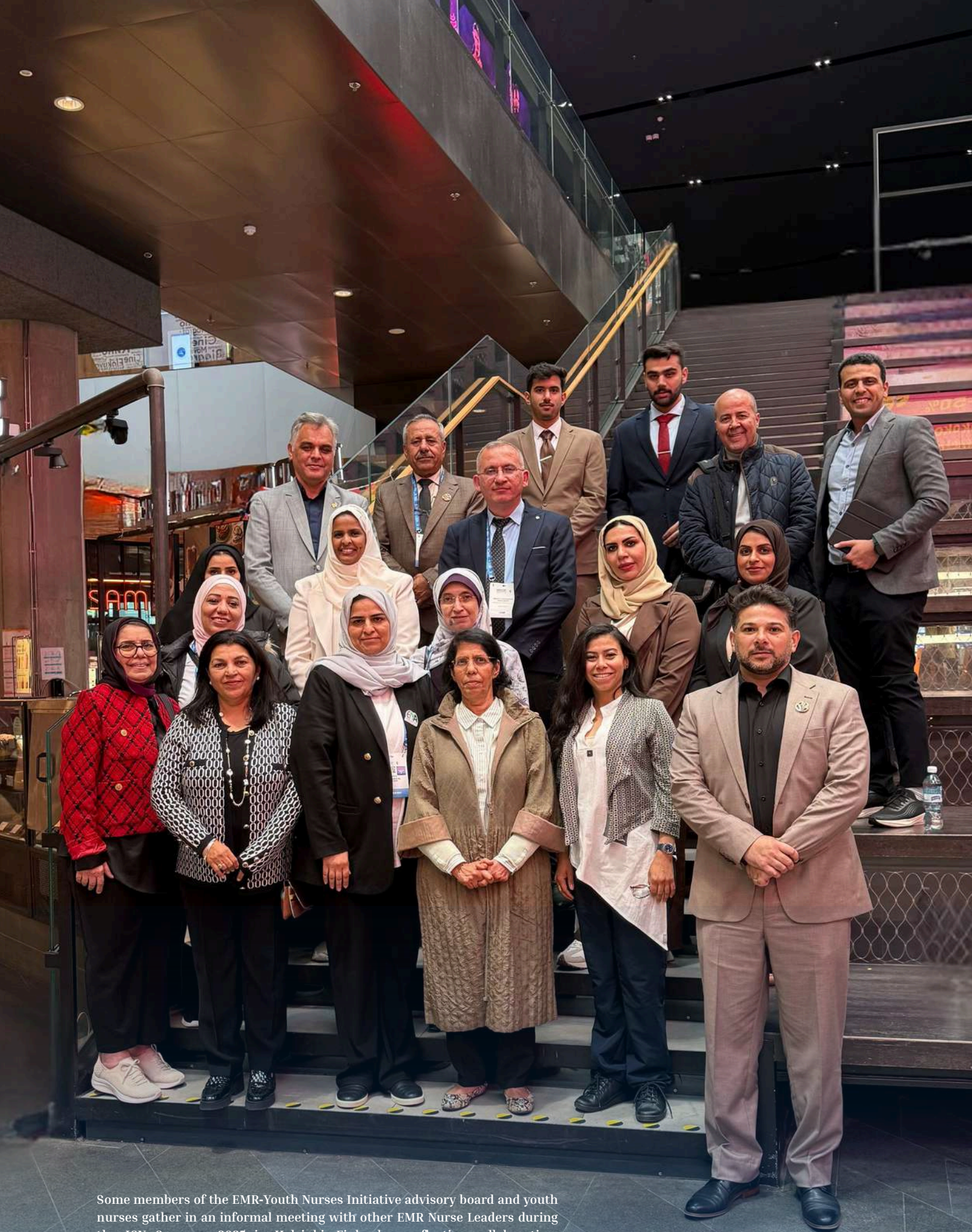
Some members of the EMR-Youth Nurses Initiative advisory board and youth nurses gather in an informal meeting with other EMR Nurse Leaders during the ICN Congress 2025 in Helsinki, Finland – reflecting collaboration, dialogue, and shared vision for advancing nursing leadership across the East Mediterranean Region.