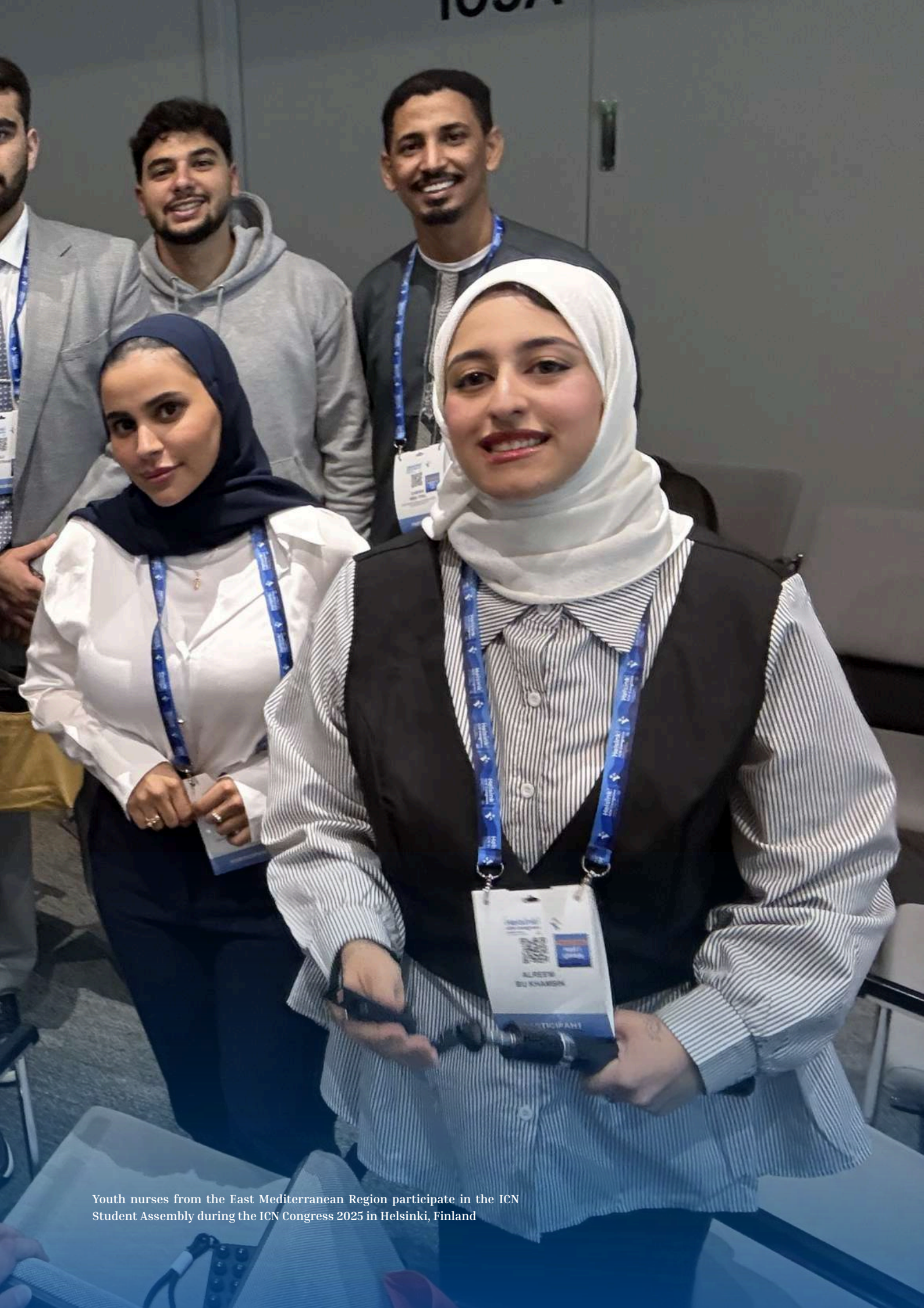
Youth nurses from the East Mediterranean Region participate in the ICN Student Assembly during the ICN Congress 2025 in Helsinki, Finland