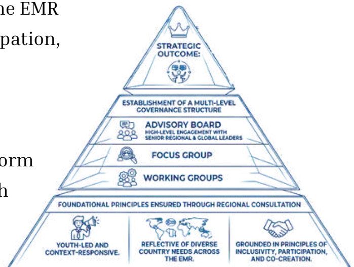
Fig.2: Governance structure of EMR -YNI

A credible, inclusive, and scalable regional platform aligned with global health governance and youth empowerment frameworks.